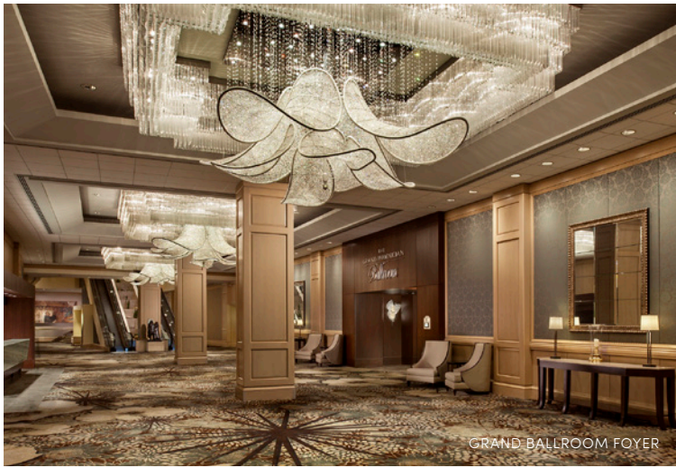
GRAND BALLROOM FOYER