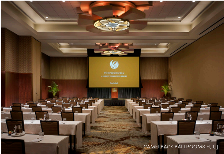
CAMELBACK BALLROOMS H, I, J