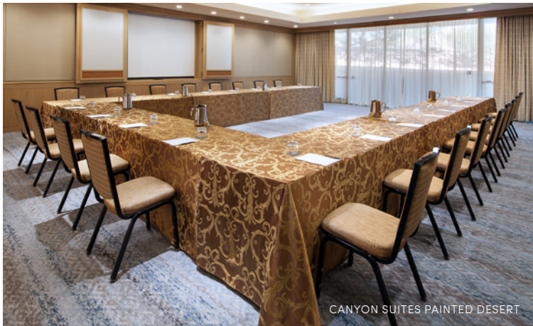
CANYON SUITES PAINTED DESERT