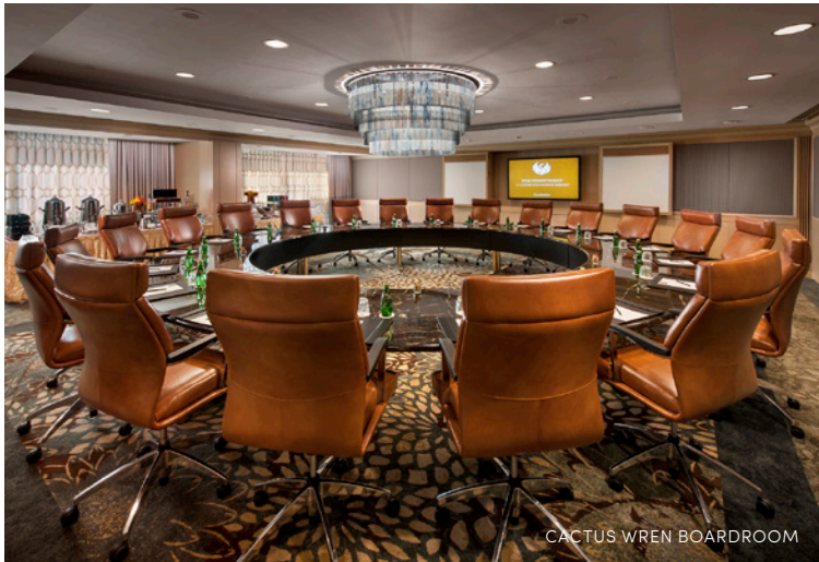
CACTUS WREN BOARDROOM